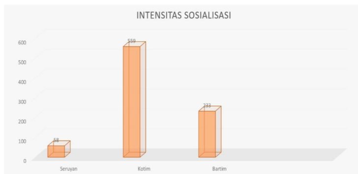
Graph 3, Concerning the Total Intensity of Socialization in District/City of Central Kalimantan Province in 2019 (Tengah, 2019)

Starting with the social movement carried out by democratic volunteers, there needs to be monitoring from the KPU itself regarding the intensity of the socialization activities in several regions in Central Kalimantan because the success of the socialization determines the increasing number of voters in the 2019 elections. The amount of intensity is quite varied with an average of approximately 233 from 11 bases started by KPU together with the Democracy Volunteer. As seen from Graph 3 about the total intensity of socialization in 11 segmentations in several districts/cities in Central Kalimantan province.