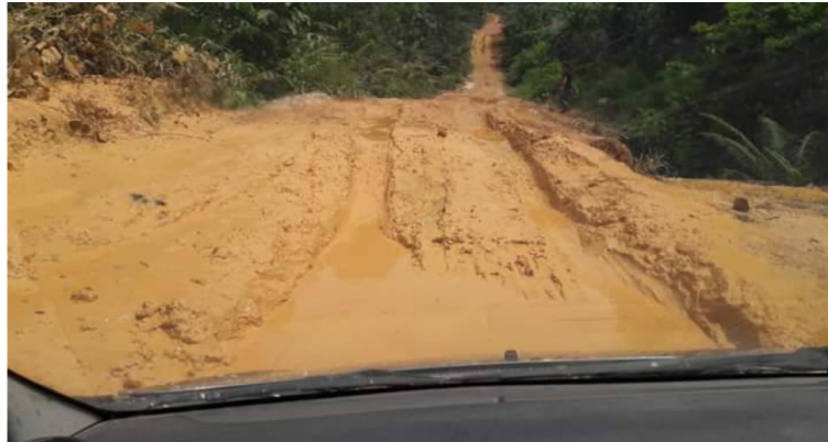
Figure 1. One of the roads in Seruyan District

From several picture, 1 and 2 are Gunung Mas and Seruyan district, a small part of the area in Central Kalimantan. Of the 14 districts/cities with a total population of approximately 2,714,859 inhabitants in 2019 (BPS Kota Palangka Raya, 2014) with a total area 153,564 km 2 (BPS Kota Palangka Raya, 2014).