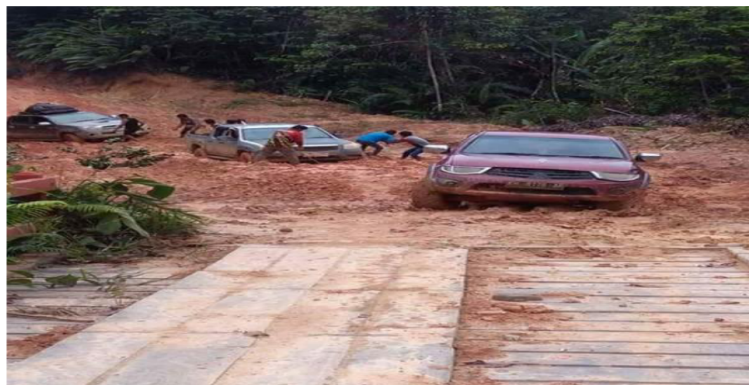
Figure 1. The condition of one of the roads in Gunung Mas district

Of the several segments that must be carried out by the election organizers, in this case, the General Election Commission ( KPU ) should be taken into account in the community. If the participation of eleven segments can be carried out then it will immediately increase the number of voters at the election party a few months ago. This is the focus of this study, to see the real condition of the function of segmentation as part of socialization, especially in Central Kalimantan. It is known that geographically the natural conditions in Central Kalimantan are very diverse consisting of wilderness areas, residential areas, rivers, lakes and swamps, plantation areas (rubber and palm oil). With access to roads mostly in the district, there are still many areas or villages where there are no roads yet. This can be seen in Figure 1, and Figure 2, from many infrastructure conditions that have not been resolved.