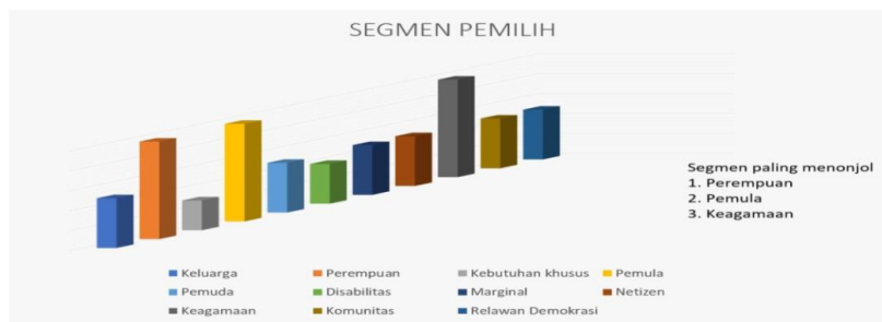
Graph 4. About 11 Voter Segmentation in District/City of Central Kalimantan Province in 2019

Graph 4. From several research results, it turned out that novice voters were a significant highlight. It was seen in novice voters that it was easier to interact and familiarize themselves with the world of political literacy in the school environment, the aim is to provide direct learning about elections to the voter participation will increase (Iskandar & Marlina, 2019). As the variety of socialization is given such as the existence of a political literacy process, also an understanding of the use of social media wisely and intelligently because of the rise of hoax news often appears on social media, therefore the importance of socialization or counseling so it can really be anticipated its existence (Husna, Novita, & Hasibuan, 2019). Bearing in mind that novice voters are prone to be abused by elements who often use black campaigns to gain votes because they lack understanding of adequate political literacy (Karyaningtyas, 2019).