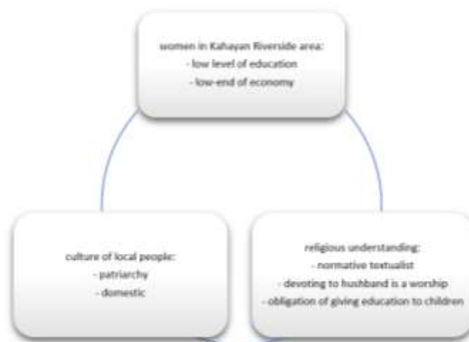
Figure 2. Relation of religious understanding with women's lives

The lecture material presented by the dai such as about the domestic obligations of a mother/woman, reward as collateral according to the normative religious text. Domestic work for women is reinforced by the perception of the local community that the woman should take care of her household and the development of her children, because that has become her nature. The relationship between the two can be seen in Figure 2 below: