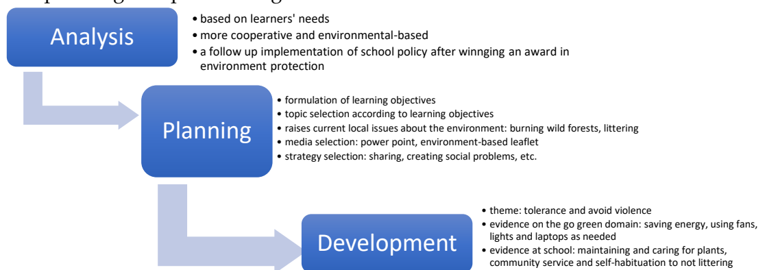
Figure 3. Lesson planning of local-based material in Islamic religion subject

The lesson planning is depicted in Figure 3.