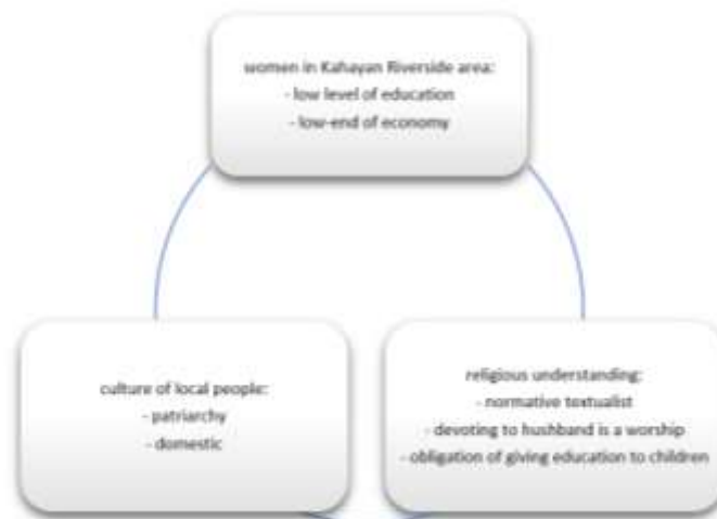
Figure 2. Relation of religious understanding with women's lives

The lecture material presented by the dai such as about the domestic obligations of a mother/woman, reward as collateral according to the normative religious text. Domestic work for women is reinforced by the perception of the local community that the woman should take care of her household and the development of her children, because that has become her nature. The relationship between the two can be seen in Figure 2 below: